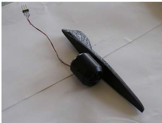
AOA Hall sensor probe